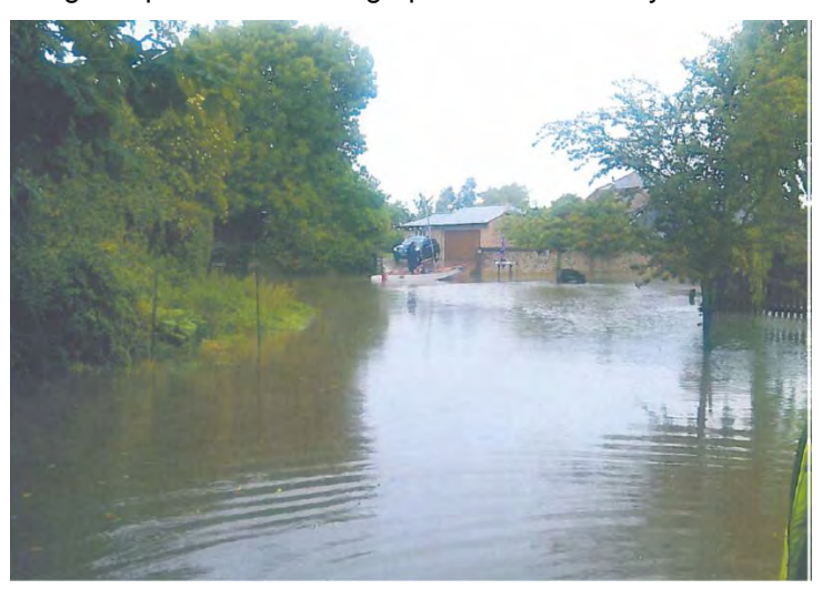
Flooding in North Mundham (June 2012)

data, and information on historic rainfall, topography and drainage. All this information was compiled and mapped using computer based Geographic Information Systems.