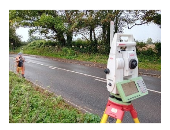
Image 3 Total station used to build up image of how bypass will connect with existing road, A284.

The base of the footpath which runs alongside the road has been marked out for preparation of surfacing. There has also been a thorough inspection into how the Lyminster bypass will link into the A284, building up a 3D image to understand the amount of materials that will be needed.