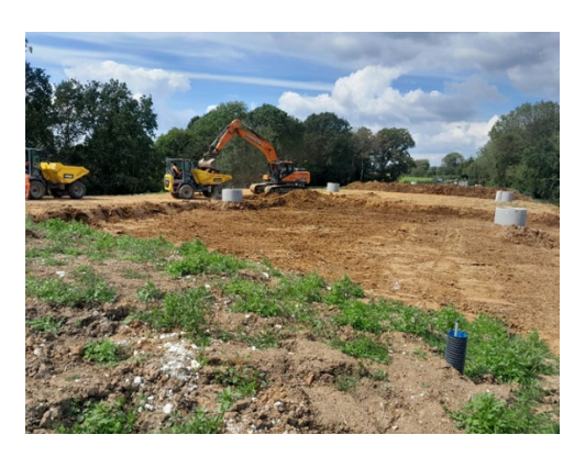
Image 1: Material being removed from the front of the surcharged to be placed further back.

Following on from last month's newsletter, the settlement of the embankment is not at a suitable level yet, we are increasing the weight over the central part of the surcharge area. Material has been taken off the front of the surcharge and placed in the middle to build up the level by a further metre. Manhole rings are being used to protect the settlement points so that surveys can resume once the work has been completed.