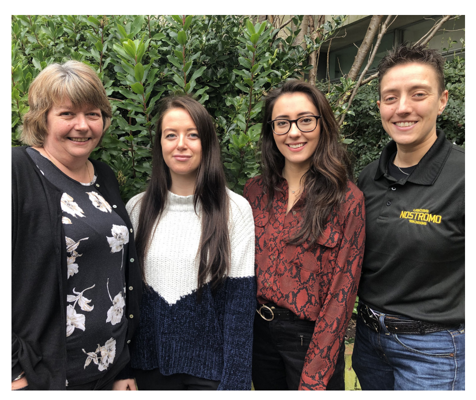
Deprivation of Liberty Safeguards (DoLS) team